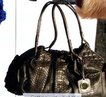
Getting just what the doctor ordered—a fit-for-fall Cashimi python slouchy doctor bag from LuxCouture