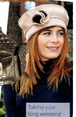
Taking your long weekend in Deauville with an original Laulhère hat