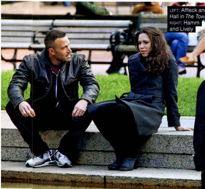
LEFT: Affleck and Hall in The Town RIGHT: Hamm and Lively