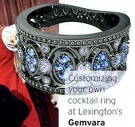
Customizing your own cocktail ring at Lexington's Gemvara