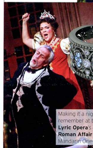
Making it a night to remember at the Boston Lyric Opera's gala A Roman Affair at the Mandarin Oriental, Boston