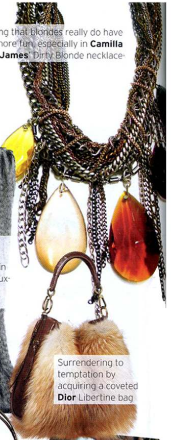
Surrendering to temptation by acquiring a coveted Dior Libertine bag