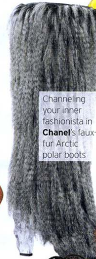
Channeling your inner fashionista in Chanel's faux-fur Arctic polar boots